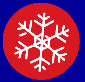
Click on Snowflake Icon to access PSD Weather Closure Procedures